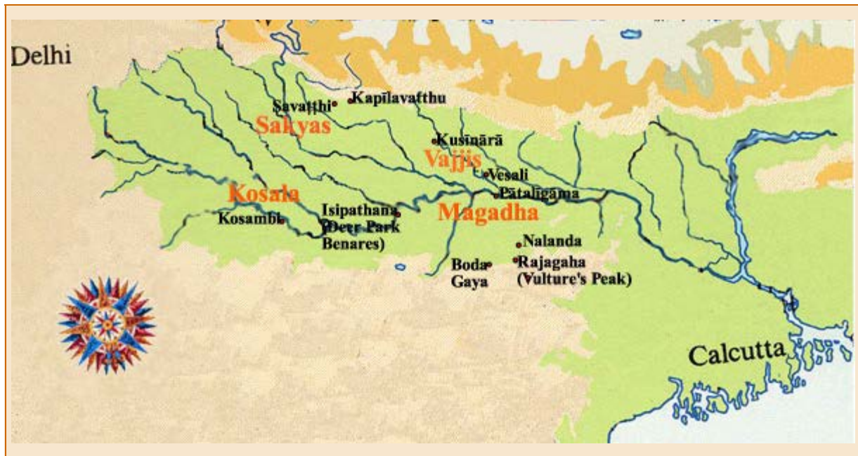
Table of Place Names

Pali Text Society: Dictionary of Pali Proper Names [DPPN].